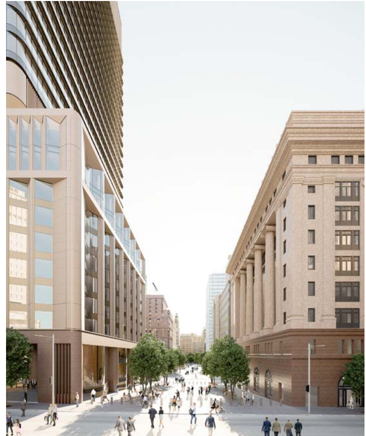
Artist's impression of Martin Place looking West from Elizabeth Street.

Time: Drop-in anytime between 2pm and 4pm