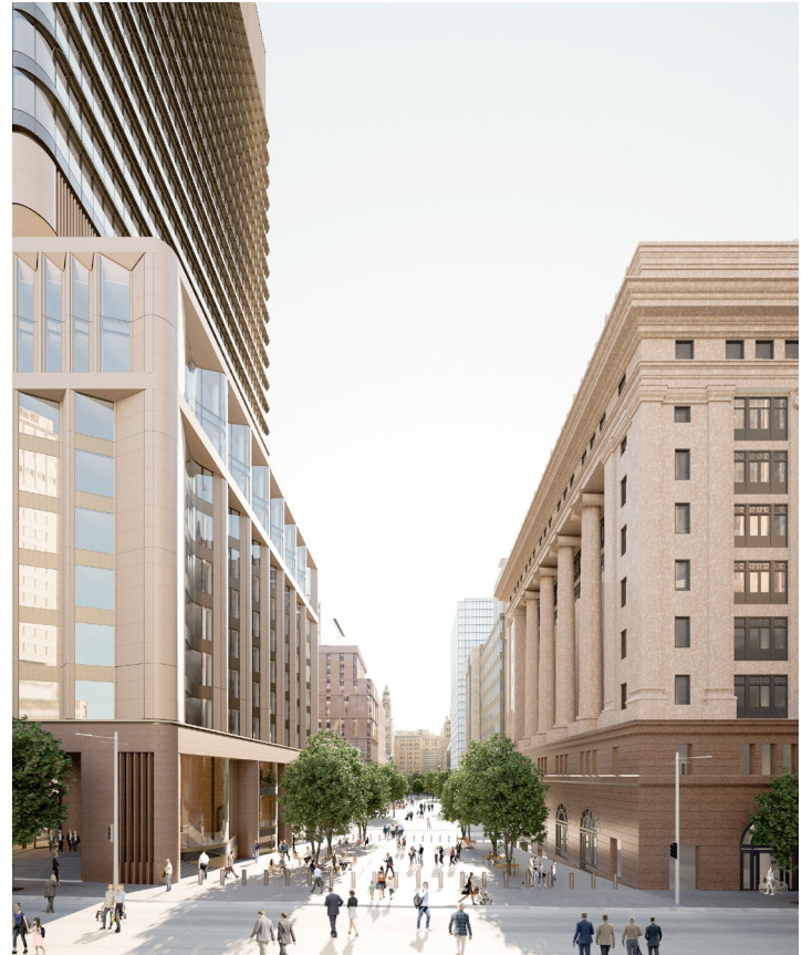
Artist's impression of Martin Place looking West from Elizabeth Street.