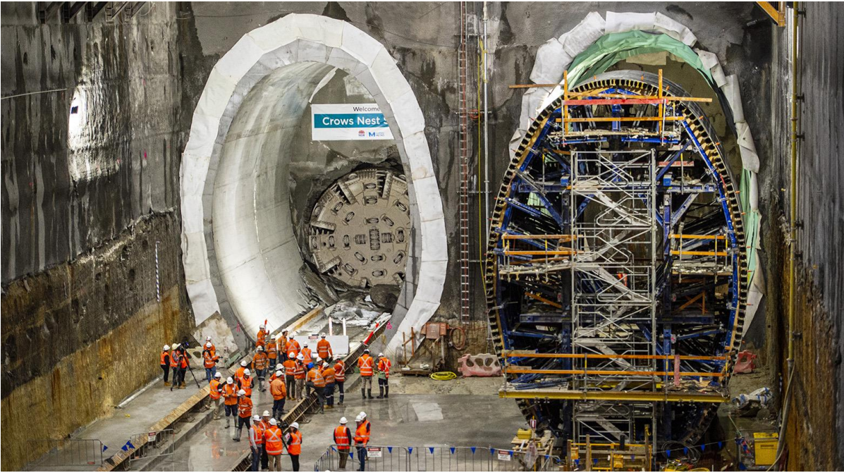
TBM Wendy arriving through the nozzle at Crows Nest on 13 June 2019. The formwork in the nozzle on the right is needed to guide concrete pours for the nozzle lining. It is removed once the lining pours are complete.