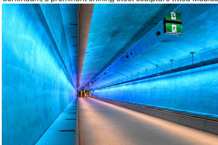
The pedestrian link connects the northern and southern concourses and has an artwork installation of light and sound.