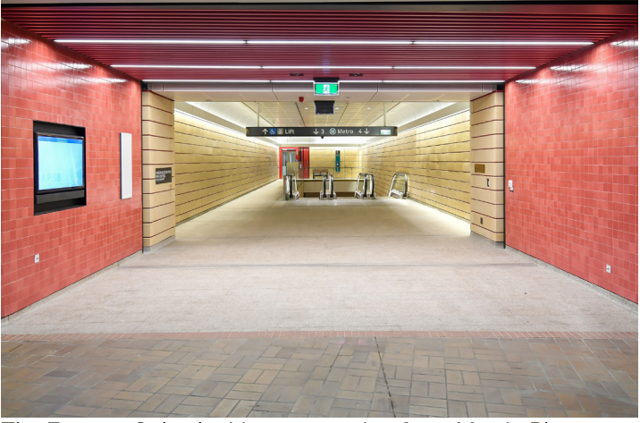
The Eastern Suburbs Line connection from Martin Place Metro Station to Martin Place Train Station.