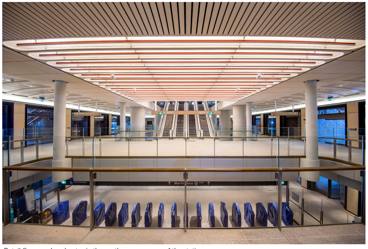
Retail floors and opal gates in the southern concourse of the station.