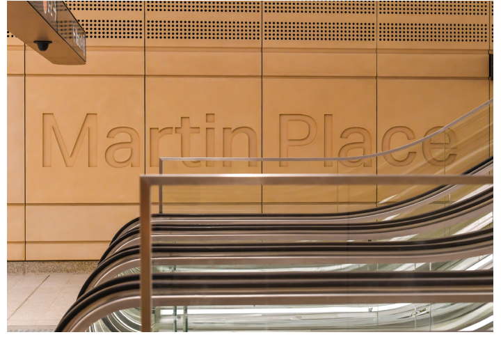
Martin Place signage embossed in glass reinforced concrete (GRC) located in the arrivals hall on the platform.