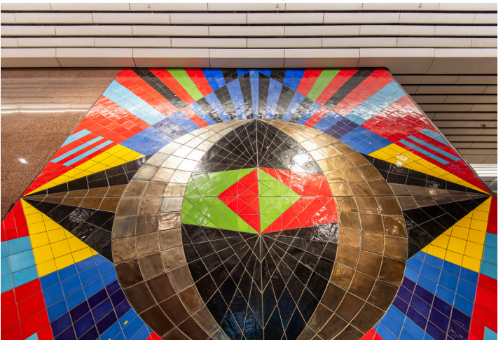
Part of "Continuum" artwork located in the south entrance.