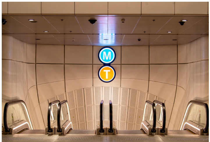
View of the incline escalators transporting passengers from the southern concourse to station platforms.