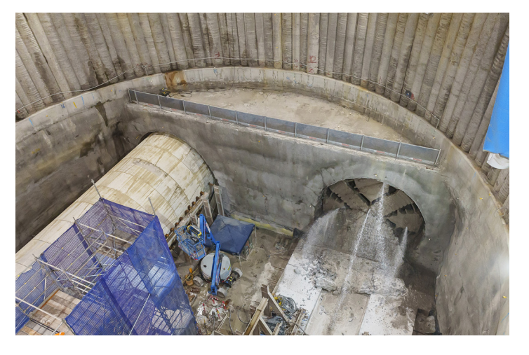
TBM Marlene arrived at Claremont Meadows in January 2024.

TBMs Eileen and Peggy are making good progress as they continue building the 5.5-kilometre southern tunnel between the Airport Business Park and Aerotropolis sites