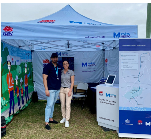
If you see us within your community, drop in to say hello and find out more about the project!