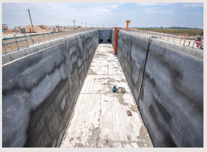
The Airport Terminal Station was completed in mid-December 2023.

In mid-2023, as part of the tunnelling works to Aerotropolis, TBM's Eileen and Peggy made their way to the Airport Terminal station box.