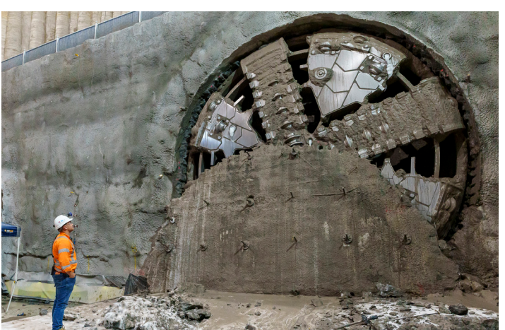
Claremont Meadows Facility TBM breakthrough.