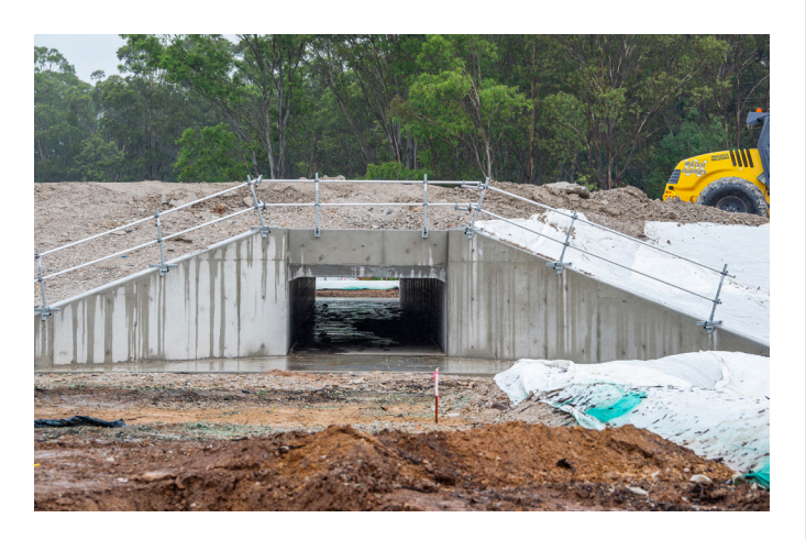
Fauna crossings provide wildlife safe passage under the metro lines.

The fauna crossings are more than just construction features; they are vital in preserving the natural habits and movements of wildlife, minimising disruptions to their habitats. This is especially important in preventing accidents on the tracks, enhancing the safety of both animals and the metro system.