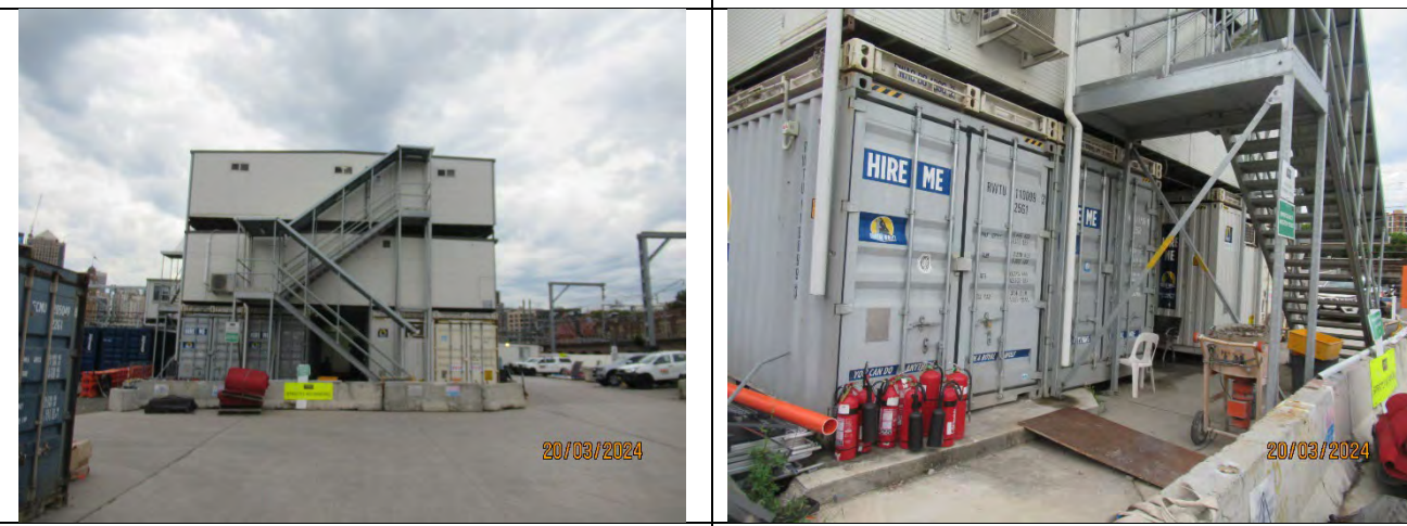
Sydney Yard: New site sheds in use by other Sydney Train contractors.

Sydney Yard: Remaining site sheds in use by Sydney Metro and LOR.