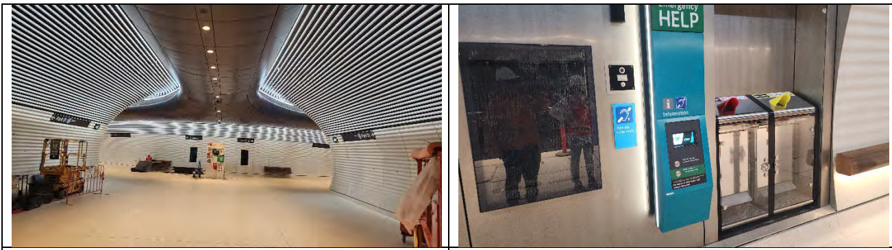
Adit – Plastic wrapping removed from noise mitigation.

Platforms - Help point and garbage bins installed.