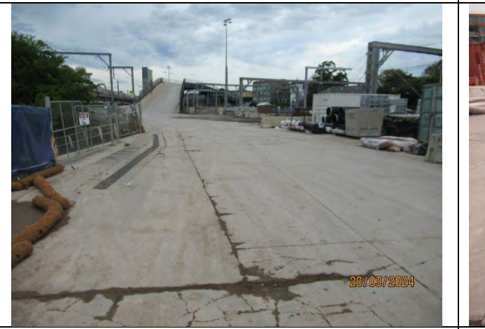
Sydney Yard: Ongoing use of the Sydney Yard by other Sydney Train Contractors.

Sydney Yard: Approximately 4 containers are used to store remaining items related to the Sydney Metro Project.