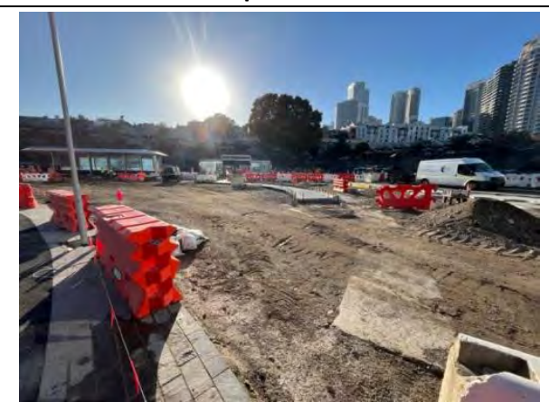
Works continued to the public domain.