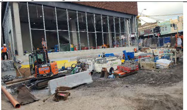
Hume St Bridge – The area was used for storage and was generally tidy. Frames for Site B glazing work were installed.

Clark Lane utility – installation of electricity and plumbing was ongoing.