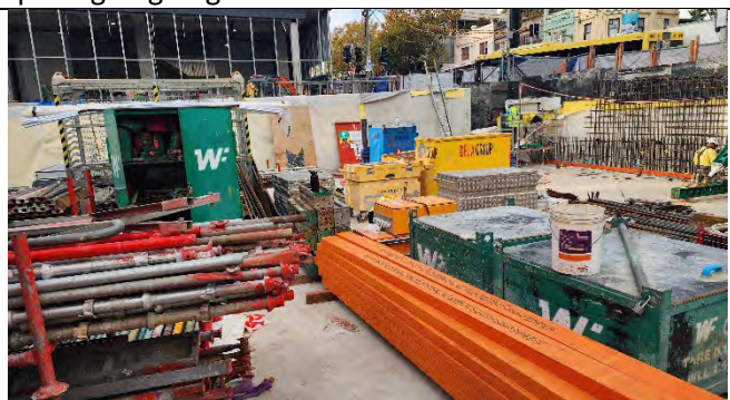
Storage between Site A and B – Material stored neatly and the area was maintained. Scaffold materials were being offloaded from site.

Clarke Lane – Transformers installed and cable pulling ongoing.