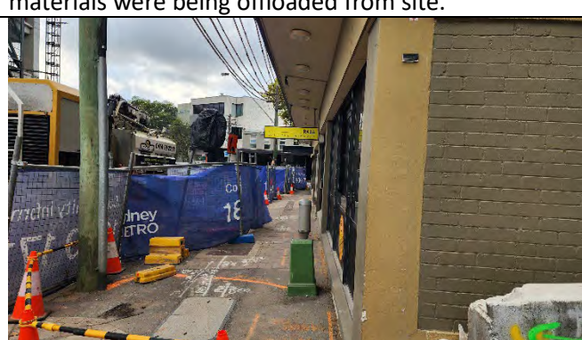
Hume Street – Access was maintained and signs installed for access to Raza Café.