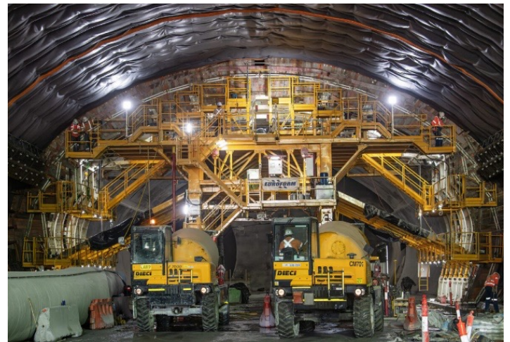
Cavern lining work at Burwood North Station site

Around one Olympic swimming pool (2500 cubic metres) of concrete will be used to line the walls and ceilings of the eastern (31m), central (70m) and western (16m) caverns at the Five Dock Station site.