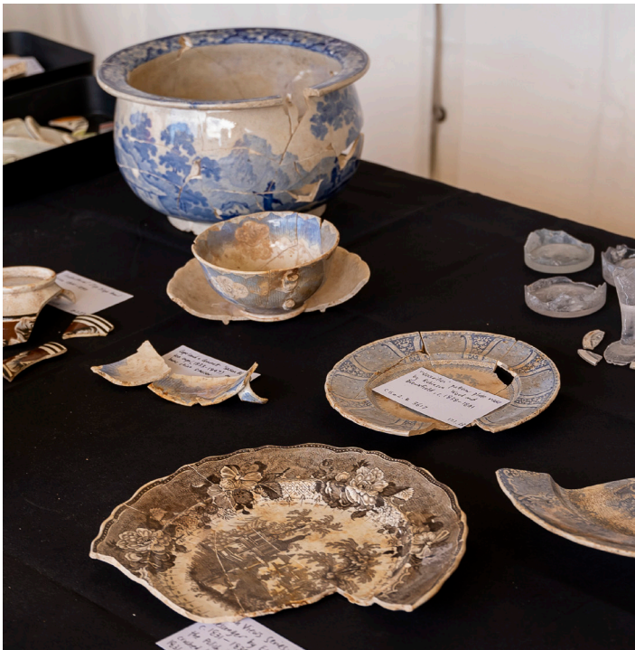
Dinner Time! Dining tables in 19th century Parramatta often showcased tableware made in Staffordshire, England, reflecting the global influence of British pottery during that era.