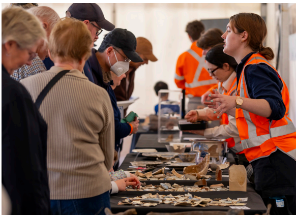
Sydney Metro's archaeology team spoke with the community about the archaeological investigations taking place at Parramatta at the Heritage Day.