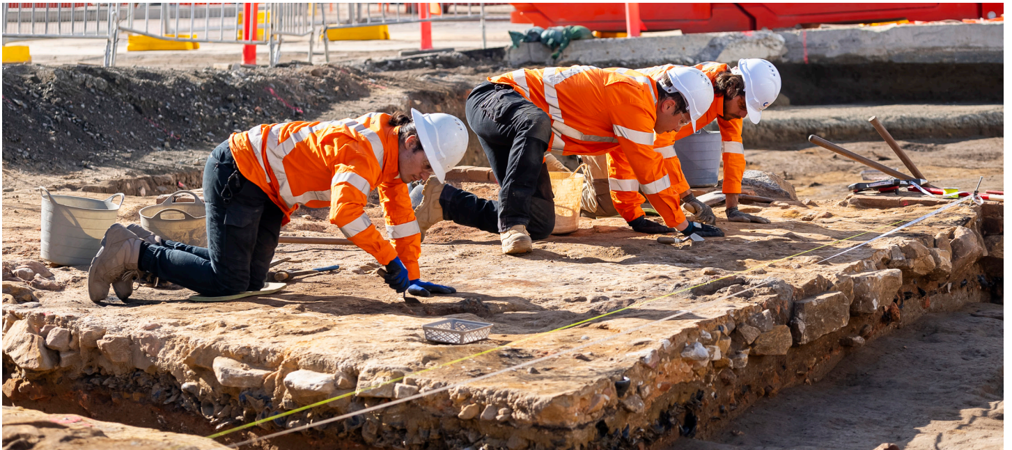
Hard at work: Archaeologists busy excavating on site uncovering artefacts that tell us more about the history of Parramatta.