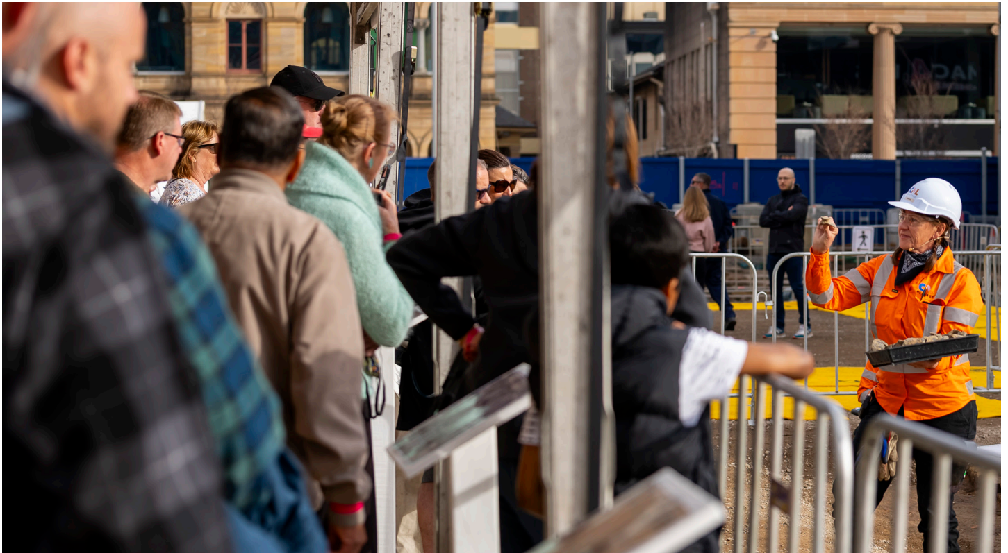
Sydney Metro's archaeology team has uncovered a wealth of history during investigations at Sydney Metro's Parramatta station site.

Parramatta is a place of extraordinary history and diversity. Heritage investigations at Parramatta metro station site can provide new insights and understanding of Parramatta's importance to First Nations people, early colonial settlement and adaptation to a new environment, daily life and urbanisation during the 19th century, and the evolution of the township of Parramatta into the city it is today.