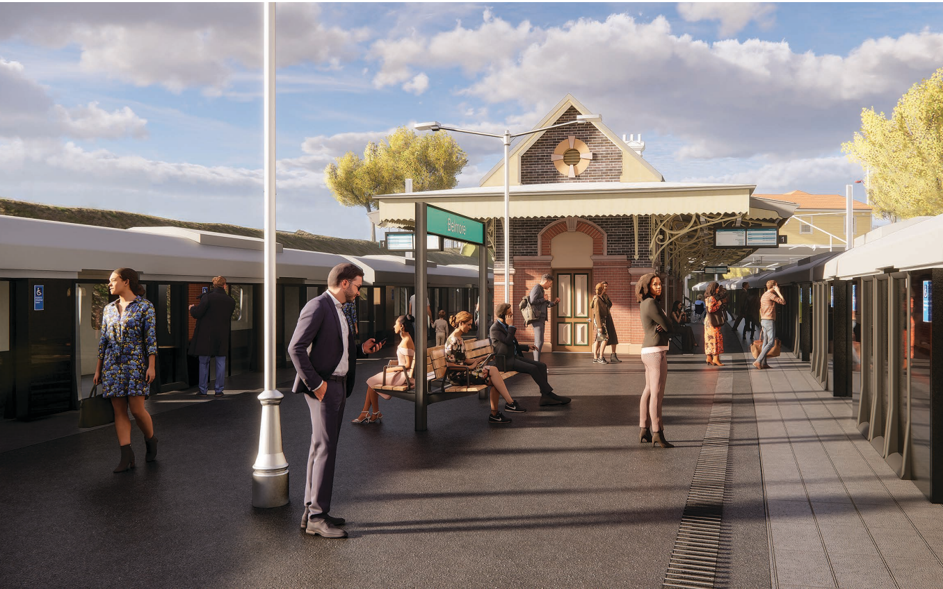
An artist's impression of Belmore Station.